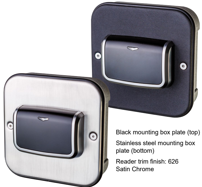
Black mounting box plate (top) Stainless steel mounting box plate (bottom) Reader trim finish: 626 Satin Chrome